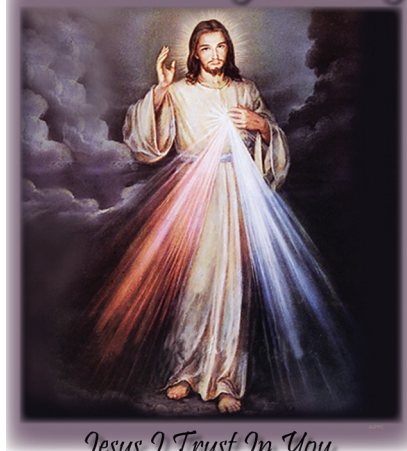
Jesus I Trust In You