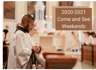
2020-2021 Come and See Weekends

Come and See Events begin in January 2021 and are designed for young men (high school age and above) who are discerning the priesthood.